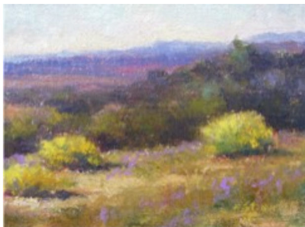
Scott Gellatly, Tres Chimasos

Perylene Red – this modern-organic warm red is highly transparent and intense in its tint. As luck would have it, Perylene's tint perfectly captured the watermelon-like glow at sunset from which the Sandia Mountains got their name. Perylene Red, when influenced by Ultramarine Blue, is also useful for capturing the subtle violets of the Southwest's topography.