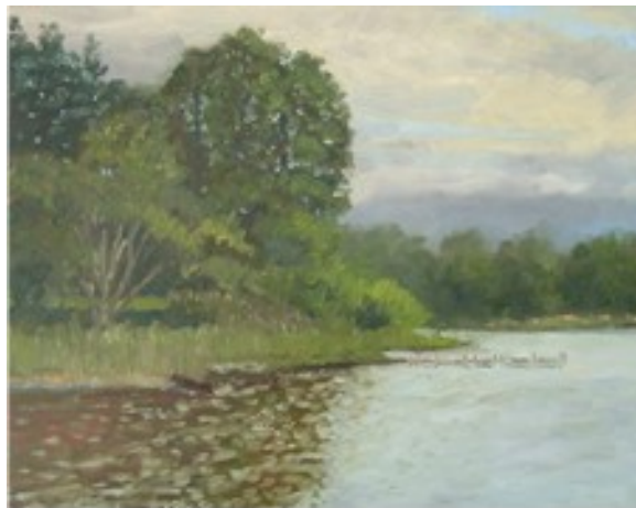
Michael Skalka, Evening at Perry's

To extend the range of the palette for east coast painting, Chromium Oxide Green and Sap Green are modified with the addition of Cadmium Yellow and earth colors. Cadmium Yellow and Ultramarine Blue alone create fairly limited greens that need a boost in chroma to replicate the mood of foliage in the east; Phthalo Green used sparingly addresses that limitation. Sometimes Permanent Green Light is used to broaden the array of green hues.