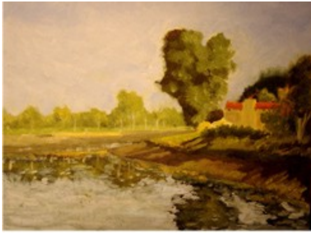
Michael Skalka, Lagoon Evening

"Painting in different geographical locations is a great learning experience that teaches the range of colors that can be mixed from the colors selected to be on one's palette."